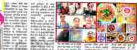
ਆਨਲਾਈਨ ਮੁਕਾਬਲੇ ਕਰਵਾ ਕੇ ਮਨਾਇਆ 'ਚਿਲਡਰਨਜ਼ ਡੇ'