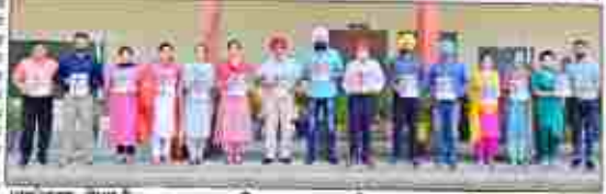
ਪ੍ਰਾਸਪੈਕਟਸ, ਕੈਂਪਸ ਰਿਪੋਰਟਰ ਤੇ ਦਿਸ਼ਾ ਮੈਗਜ਼ੀਨ ਜਾਰੀ