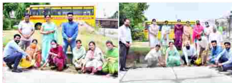
Guru Teg Bahadur Khalsa College of Education, Dasuya | 29